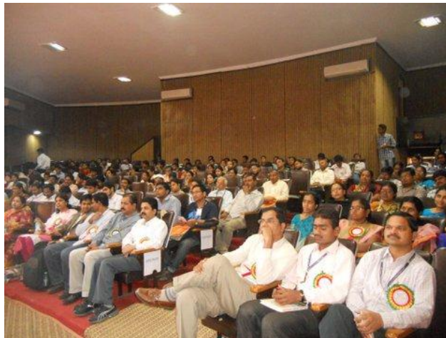
Fig. 6 Participants of felicitation function