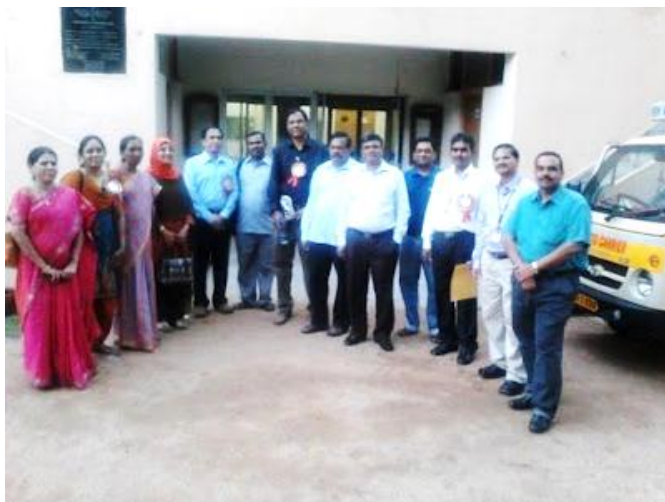
Fig.19 UCE, ECE & CSE staff &organizers